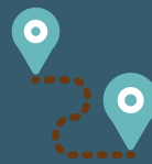
Hands-on & Site-Specific Field Test

Each team of student experts competes in two areas: