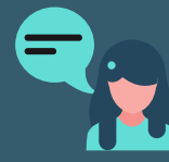
Team Oral Presentation