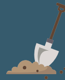
Soils & Geology