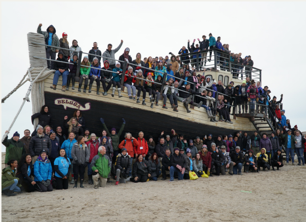
The 2019 competition was hosted in Churchill, creating a once in a lifetime opportunity for many students!

The Manitoba Envirothon is an annual hands-on Environmental Education competition for high school students. It is designed to encourage team work, problem-solving skills, and public speaking skills while fostering an appreciation for current environmental issues.