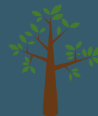
Forestry & Plant Ecology