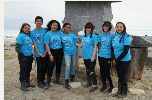
The Provincial Event has 22 teams compete from across Manitoba.