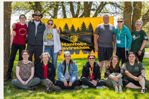
The Manitoba Envirothon is run by a dedicated volunteer Steering Committee.