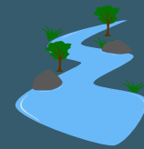
Theme: Integrated Watershed Management