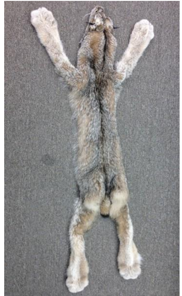
Lynx (larger size, larger paws, fully black tipped tail)