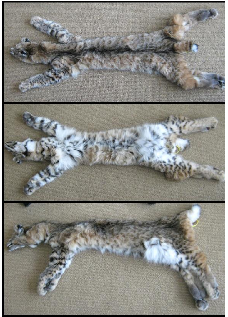
Bobcat (spotted, smaller size, half black and white tipped tail)