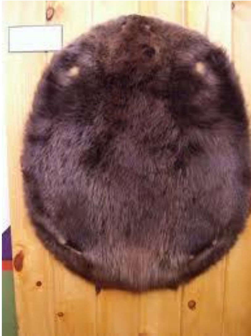
Beaver (larger, round, darker colour)