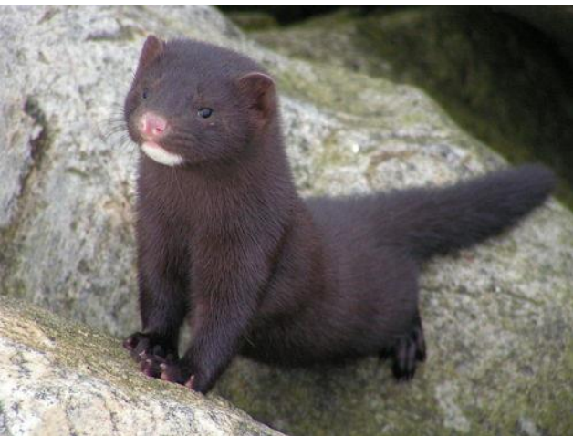
American Mink (white chin mark, slim tail)