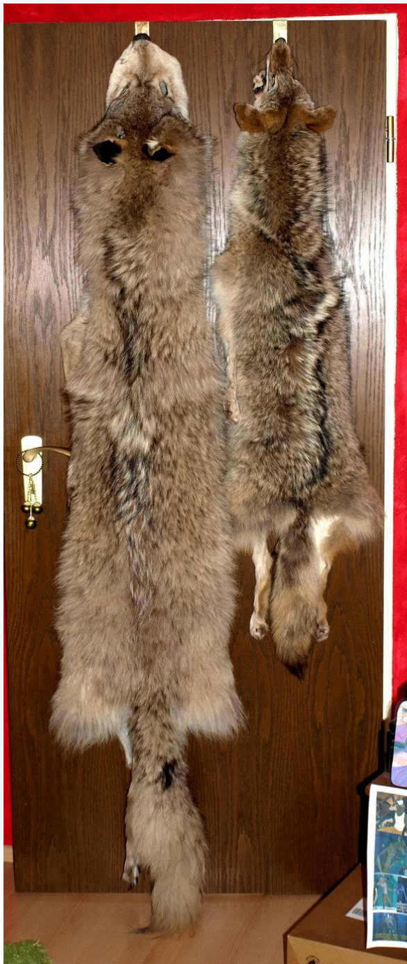
Wolf vs Coyote