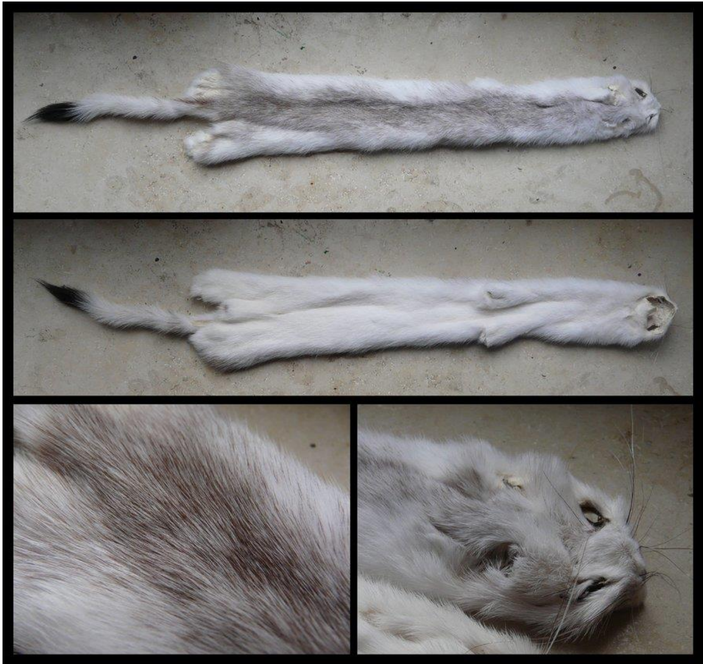
Ermine (black tipped tail, slim and long)