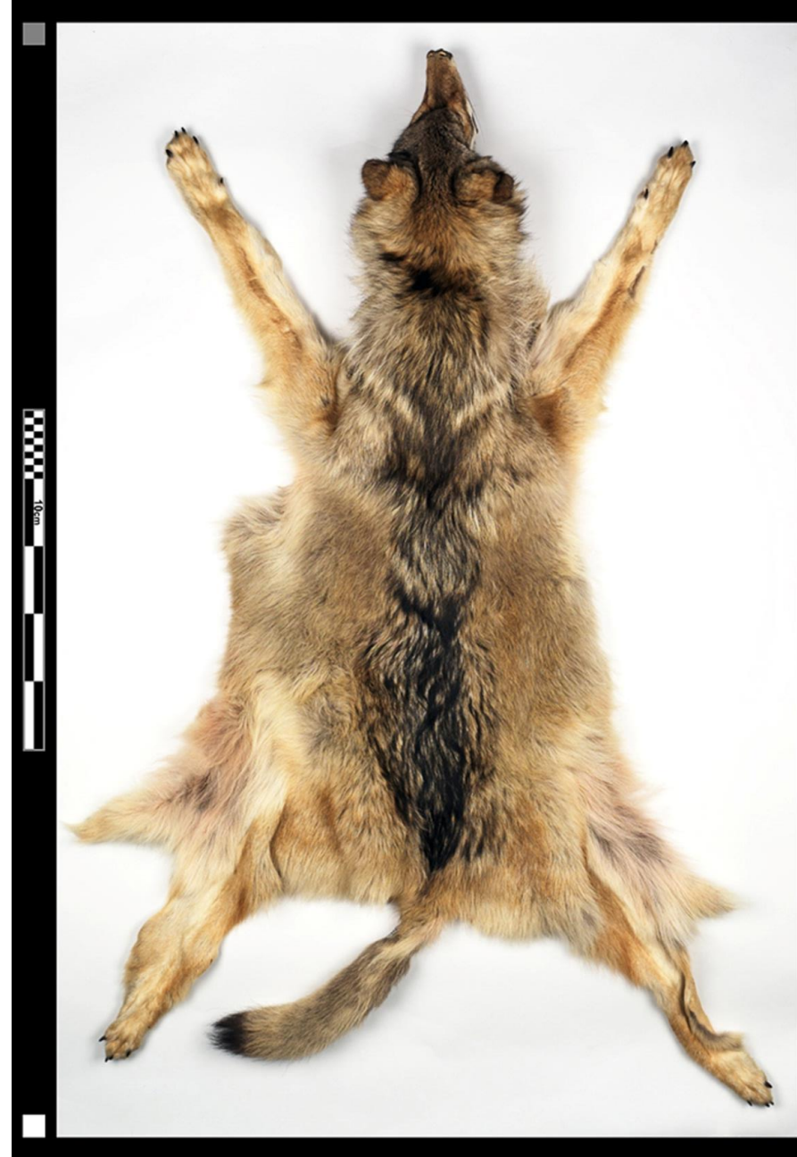
Gray (Timber) Wolf (much larger than coyote, longer legs, broader face, variety of colours)