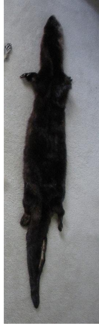
River Otter (Long furred tail, fur feels slightly oily to touch)