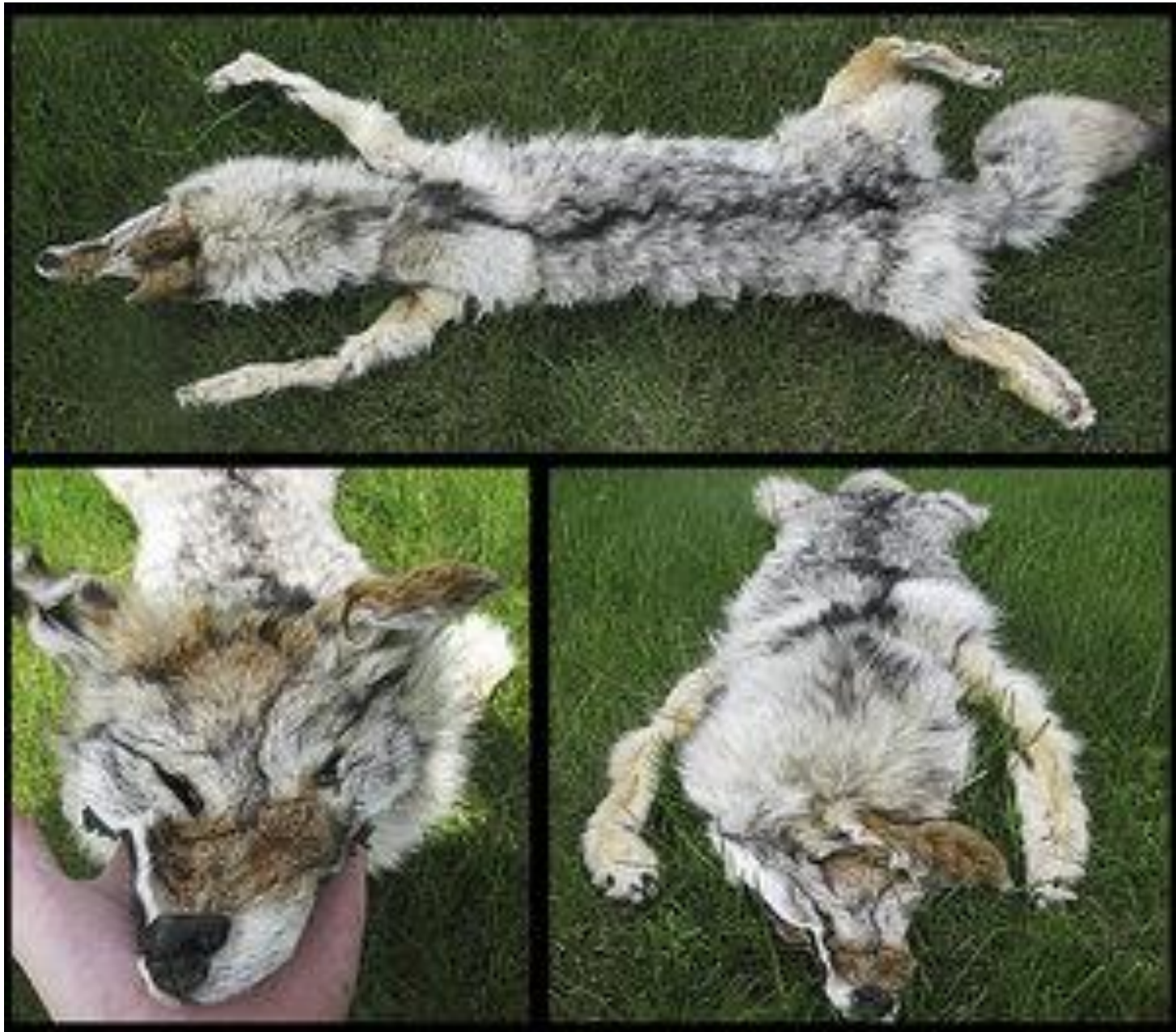
Coyote Pelt (narrow face, smaller than wolf, shorter legs then wolf)