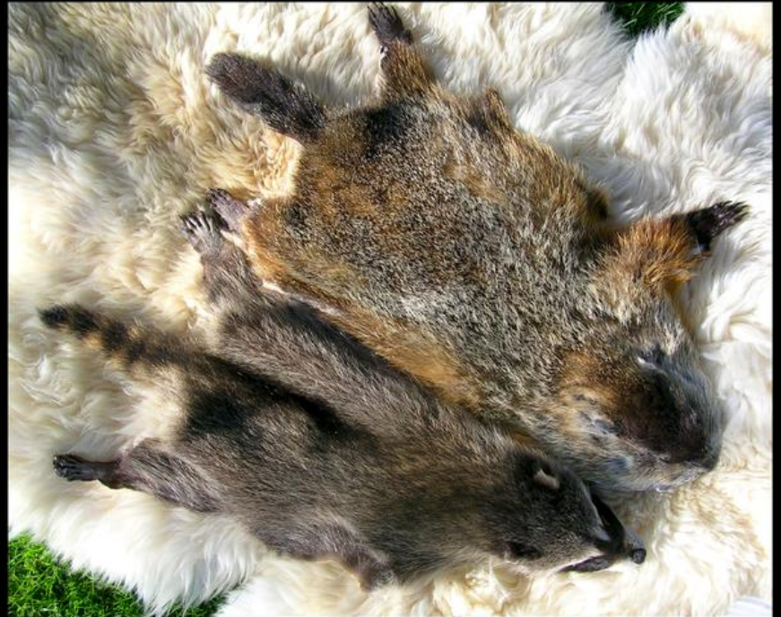
Raccoon, Groundhog (coarse fur)