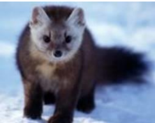
Pine Martin (orangey/cream coloured chest, large ears)