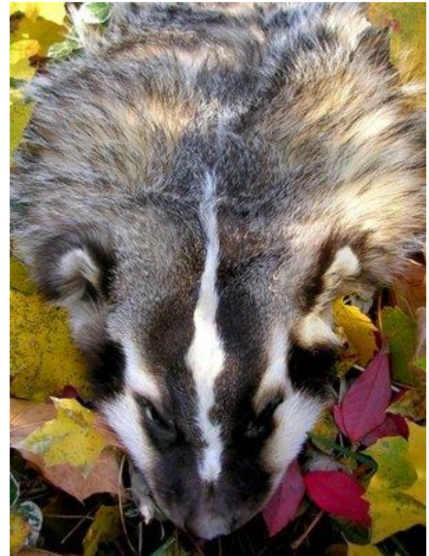
Striped Skunk (two white stripes or more), Raccoon (banded tail, mask on face), American Badger (three white face bars)