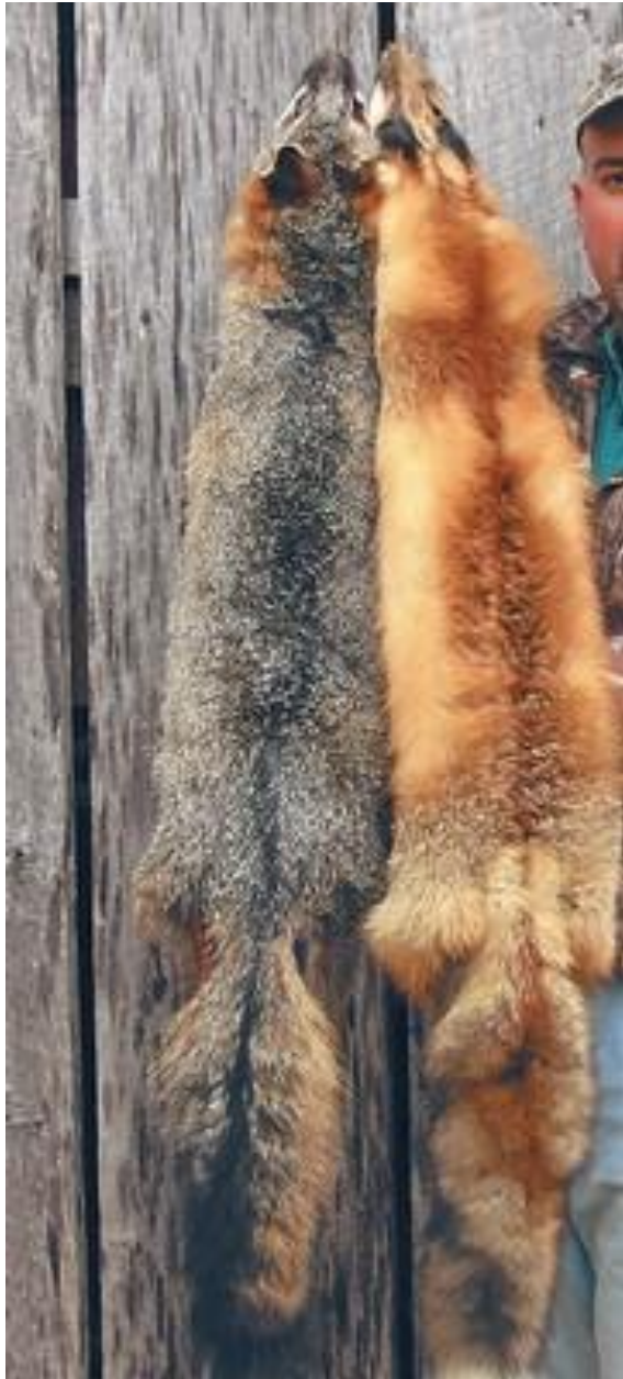
Grey Fox, Red Fox